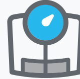
Control del peso