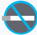
Dejar de fumar/nicotina