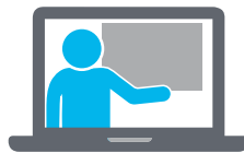
Educación en línea