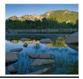
Public Employees' Benefits Program 901 S. Stewart Street, Suite 1001 Carson City, Nevada 89701