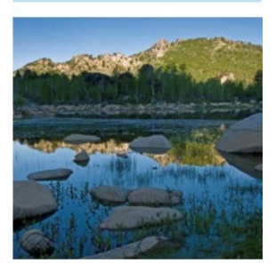
Public Employees' Benefits Program 901 S. Stewart Street, Suite 1001 Carson City, Nevada 89701